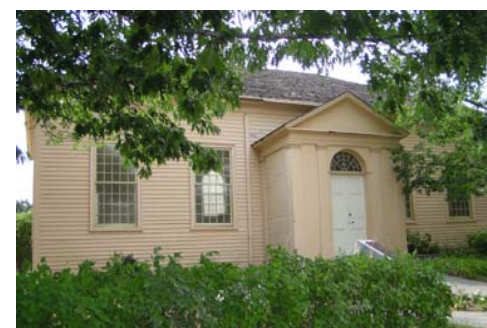
Free Meeting House (1821)

1821—Baptist influence in the area of the Bend (later named Moncton) led to the erection of the Free Meeting House.