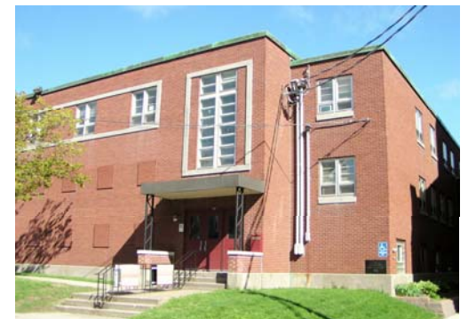
Christian Education Building (1958)

1945—WWII Memorial Window, honouring the 26 church members who made the supreme sacrifice was installed, with a plaque listing the names of 278 men and women of First Baptist Moncton who served.