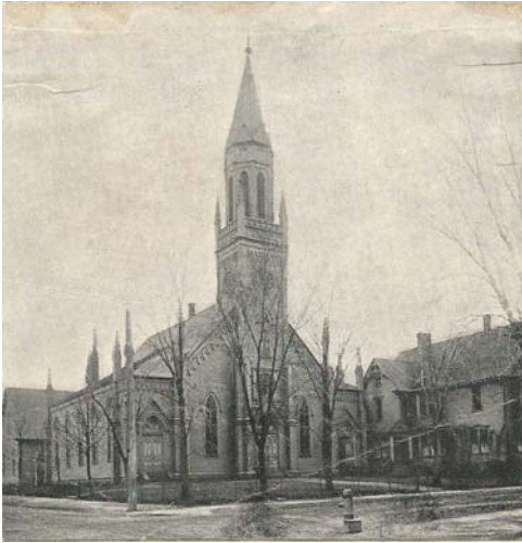
First Baptist Moncton 1857-1913 with 1887 expansion

1857—The congregation built their own House of Worship at Church and Queen Streets.