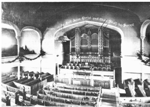
Church interior with Casavant Organ (1909)

1908—The "Forward Movement", a plan to liquidate the $14,000 debt, carry out renovations and install a new pipe organ was executed.