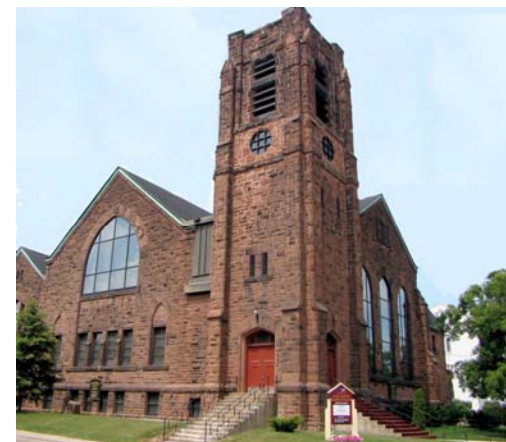
Church (Built 1915)