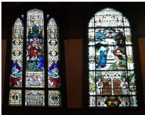
War Memorial Windows