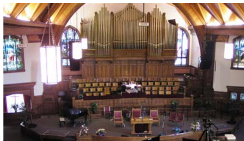
Renovated Interior (2011)

2011—June saw the approval for major upgrades of modern lighting, sound and technical equipment, renovations in the Sanctuary and Vestry, and repairs to the exterior stonework and roof lines.